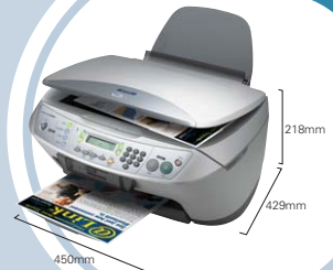
EPSON Stylus™ CX6500 Weight=Approx. 9.0kg

*To use the USB port, your PC must conform to PC98 specifications, and have Windows® preinstalled. Consult the documentation provided with your PC for further information about USB connectivity. Note also that printing errors may occur if non-standard cables or more than two hub connectors are used.